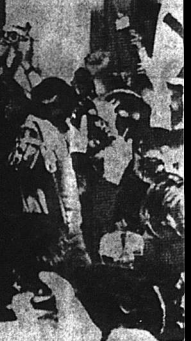
Sen. Robert Kennedy, D-N.Y., receives an enthusiastic greeting on arrival at San Francisco Airport at Johannesburg, South Africa, yesterday to begin a speaking tour of the white supremacy as-

Anyone in the Greater Vallejo Area is privileged to send letters to "Opinions of the People," a column of public opinion. Opinions in this column, however, do not necessarily represent the policy of the publisher. Letters must be confined to 200 words or less. You must sign your name and address, but your name will not be published if you make such a request and addressed to the Editor, Times-Herald.